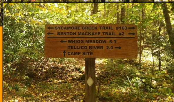
Unicoi Crest to Tellico Fish Hatchery