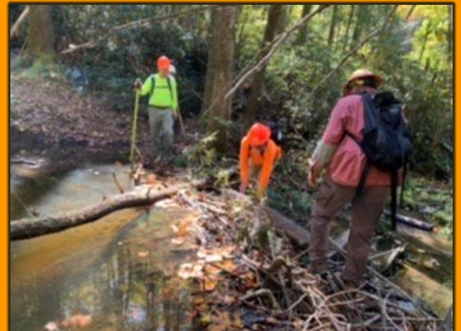
The work on Section 10a. Not for sissies!