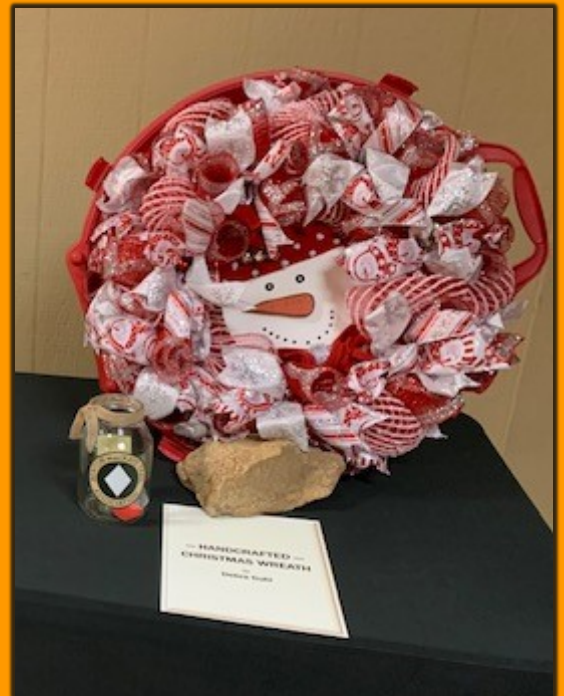
Debra Guhl donated a handmade Christmas wreath. Such wonderful creativity!!