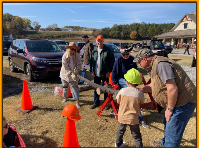
Mother and son working together!