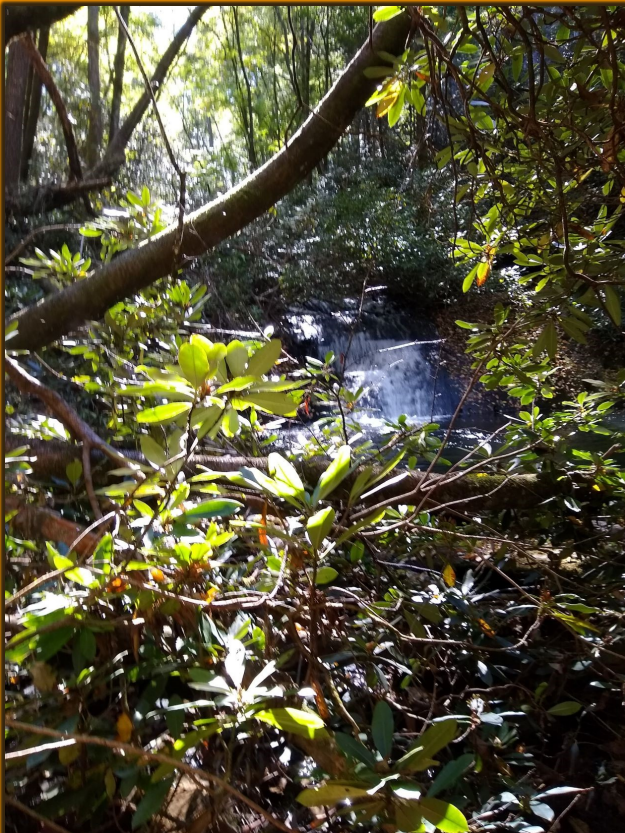
Shadow Falls