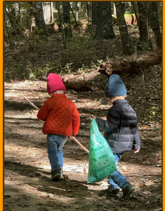
Early lessons in “Leave No Trace!”