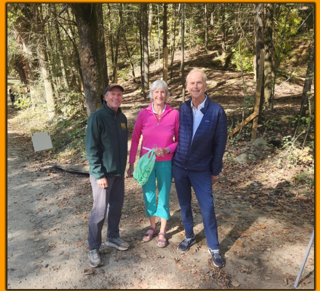
This couple came all the way from the United Kingdom!