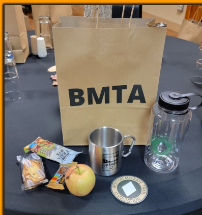
The Goody Bags did not disappoint!