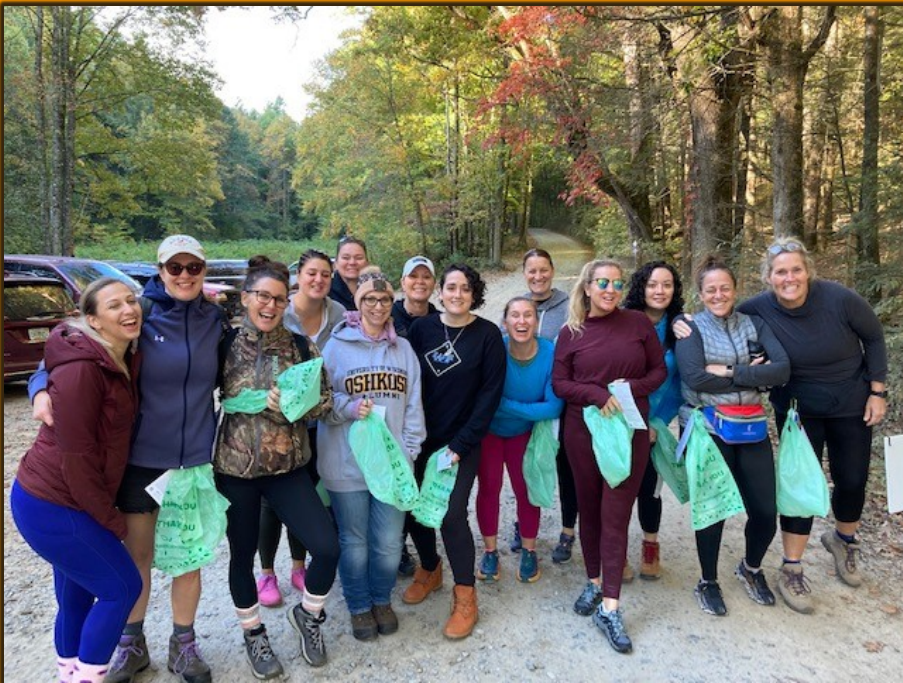
Excited to help!! Thank you all so very much!!!!