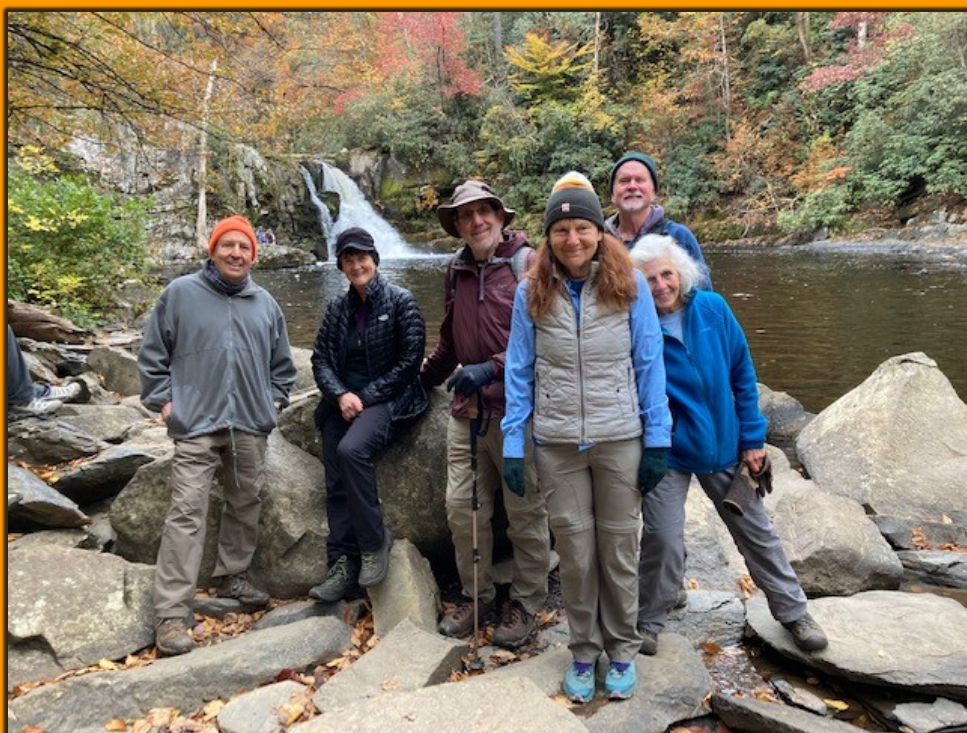
Worth the trek!!!

The next day we navigated the “Tail of the Dragon,” to Twentymile Ranger Station and hiked the Twentymile loop. This was a very beautiful trail and considerably more moderate hiking than the Little Bottoms Trail of the previous day. After our hike, we rewarded ourselves with dinner at Tapoco Lodge. Thursday morning, we set out on the Rabbit Creek Trail only to find a wet river crossing soon after beginning the hike. We changed plans and hiked several miles out and back on the Cooper Road Trails. Although we could have done without the cold mornings, these were a couple of great hikes with absolutely beautiful scenery. I would definitely return to Abrams Creek Campground in warmer weather.