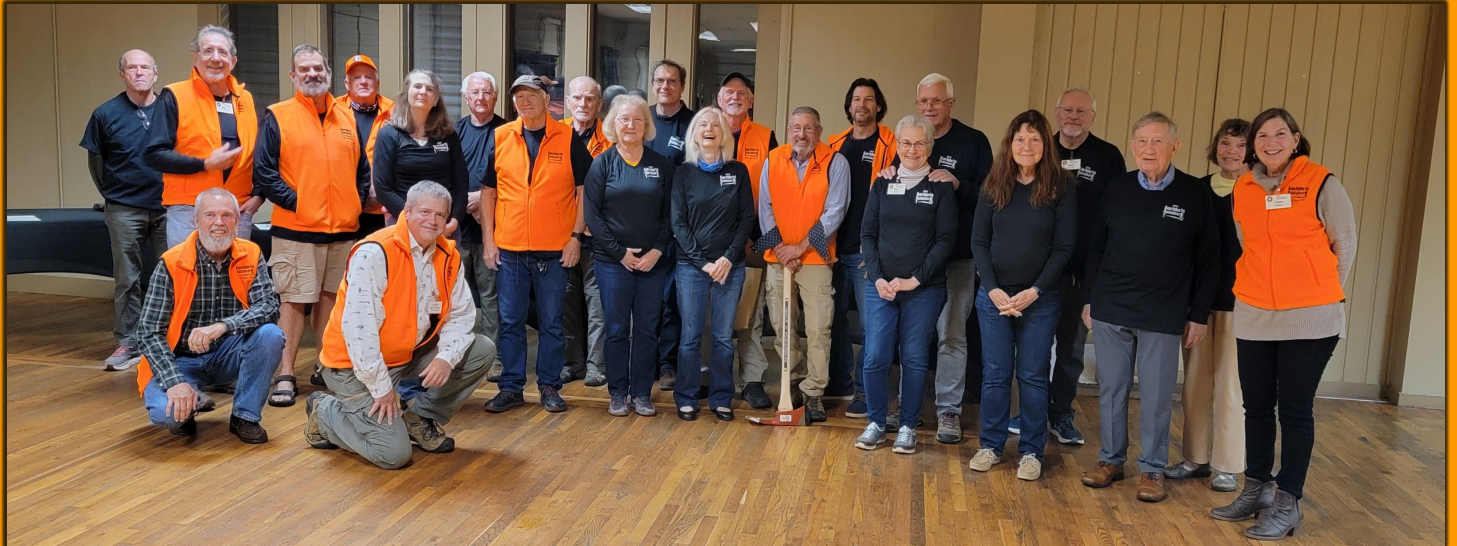
Thank you!!! You are the nuts and bolts of the BMTA!!

Nine hike leaders who led five or more hikes during the year received a 2022 Hike Leader T-Shirt.