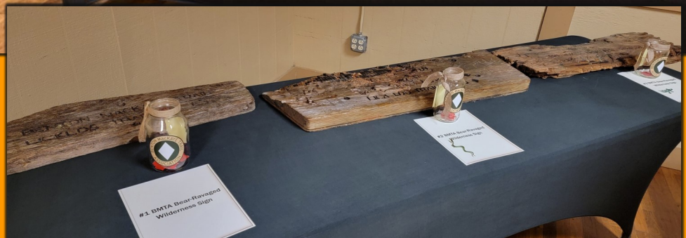
Among the unique items in the raffle were three bear-ravaged BMTA signs! What a great way to recycle and create a wonderful memento of the trail!