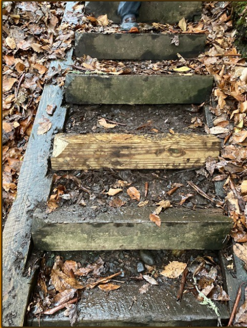
The satisfaction of a job well done!