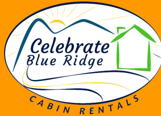
CELEBRATE BLUE RIDGE CABIN RENTALS