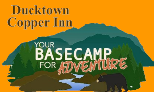
THE DUCKTOWN COPPER INN