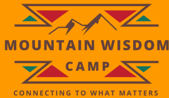
MOUNTAIN WISDOM CAMP