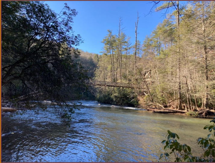
The Swinging Bridge - one of the BMT's iconic destinations.

Six members, and guest Vickie Yunker, completed the eight-mile round trip from GA 60 over Toonowee Mountain to the Swinging Bridge. The Toccoa River sparkled and the crisp, winter air was invigorating as we basked in stunning long-distance views.