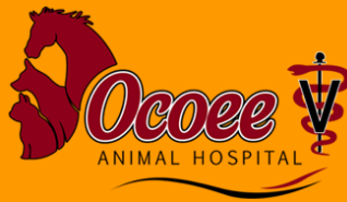
OCOEE ANIMAL HOSPITAL