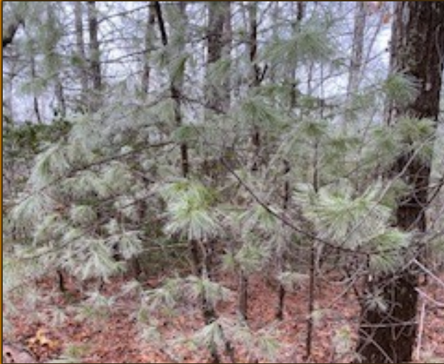
Ice crystals sparkled on the tree branches!