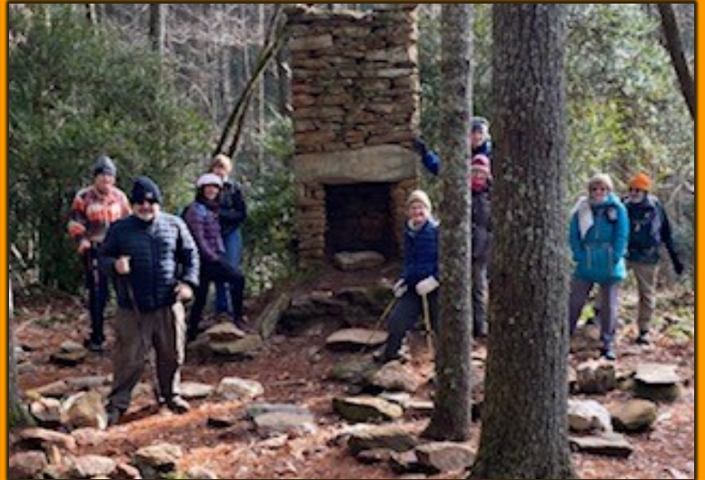
We took a rest at the remains of an old home place along the trail.