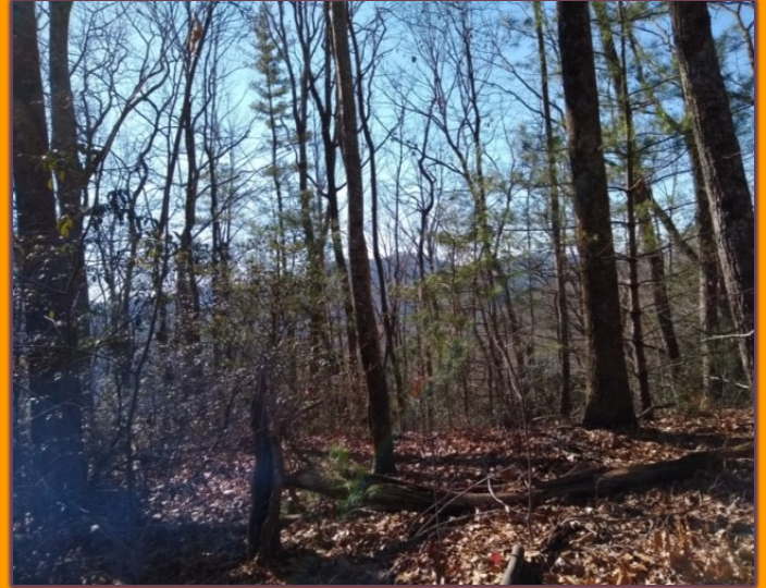
View from the top of Toonowee Mountain.