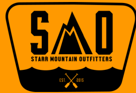
STAR MOUNTAIN OUTFITTERS