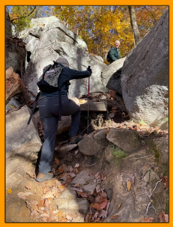
Hey, where is the trail for short legged people?! These steps are for Mountain Trolls!!