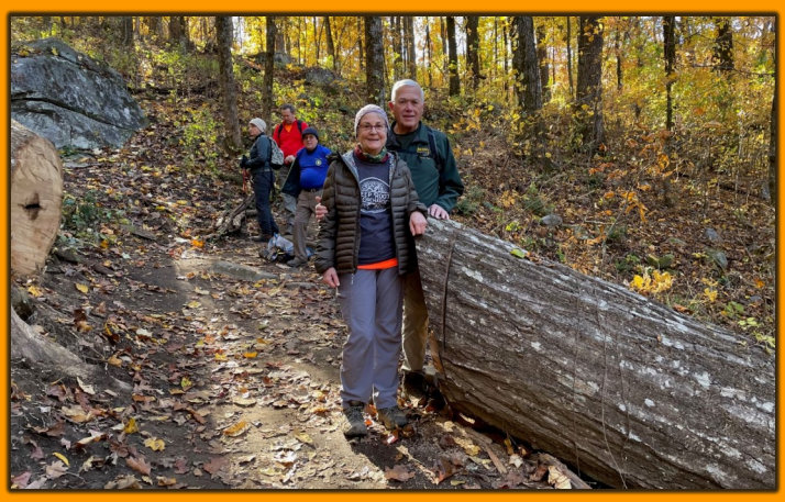
Sure glad we did not have to clear this blowdown!