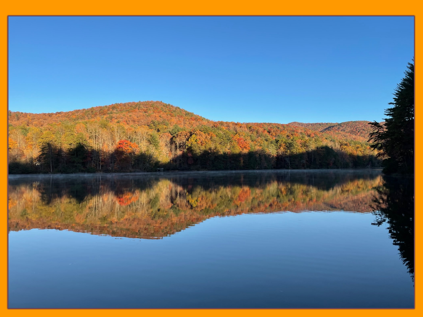
Unicoi Lake shimmers in fall's golds.