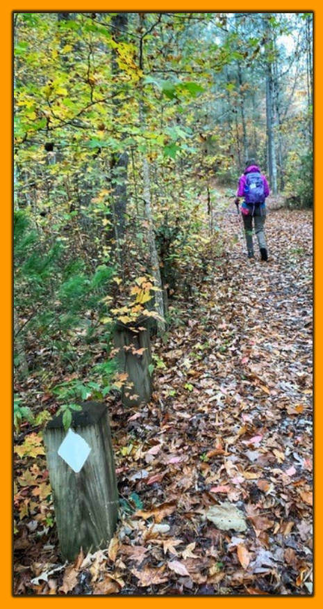
Forest Solitude

Memberships purchased after October 1 will be good thru December 31, 2022.