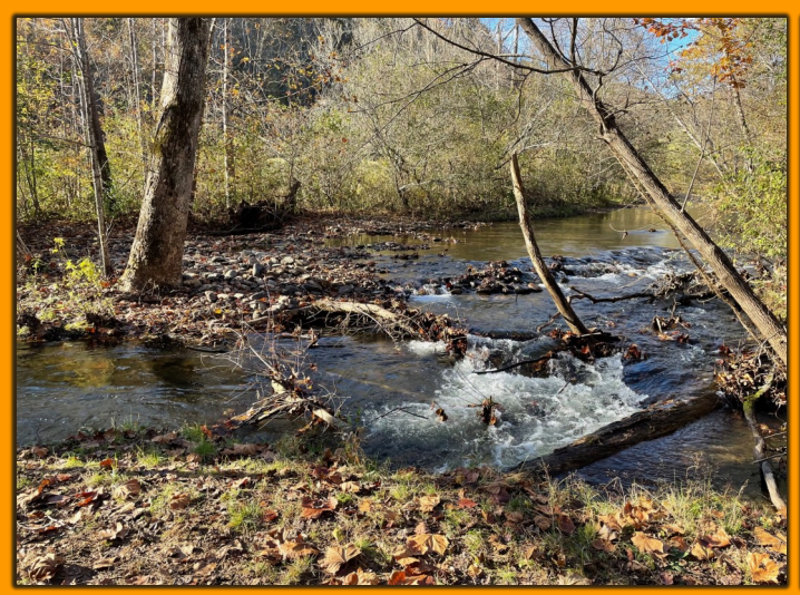
Smith Creek on the Bottoms Loop Trail.