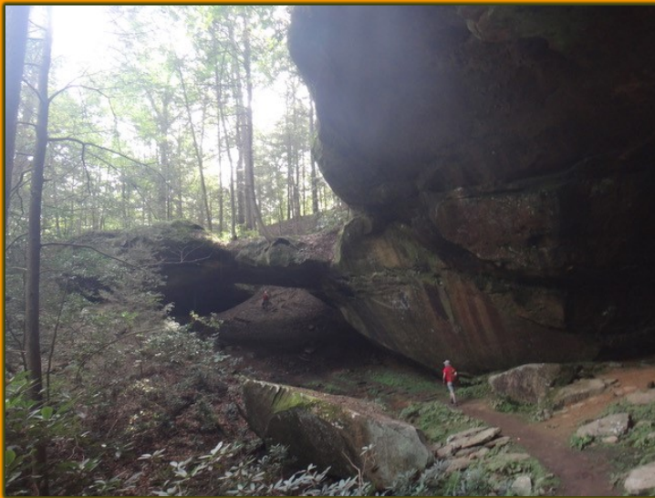
Yahoo Falls Arch and the massive “Rock House” beside it.

There is a lot of history to be found in the BSF as well. On our first whole day in the BSF fork we hiked to Charit Creek Back Country Lodge which includes one of the oldest man-made structures in the National Park System. Charit Creek is a lodge in the same fashion as the Hike-Inn and Mount LeConte. On another day we went for a ride on the Big South Fork Scenic Railway to the old mining community of Barthel. We followed that up with a visit to the Blue Heron mining community which is now a huge interactive historical display operated by the National Park Service. From there we hiked the Blue Heron Loop where we found abandoned coal mine shafts and veins of coal in the cliffs.