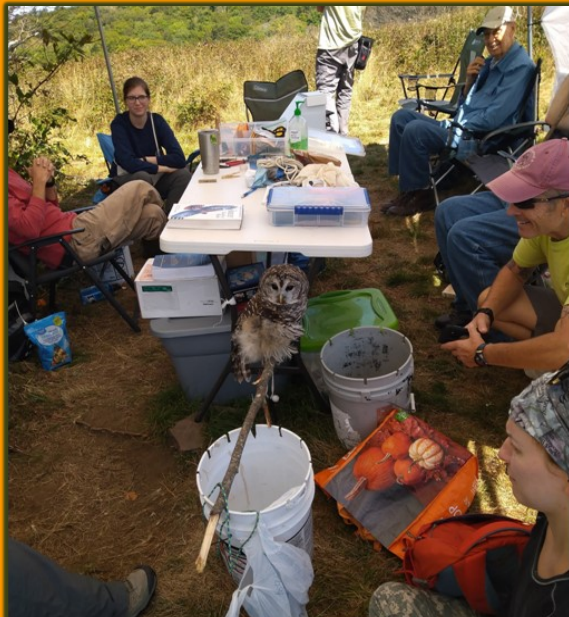
Most of the birding crew was from Mississippi State University. Shown in the foreground is a young Barred Owl which was recently rescued from an accidental encounter with a fence.