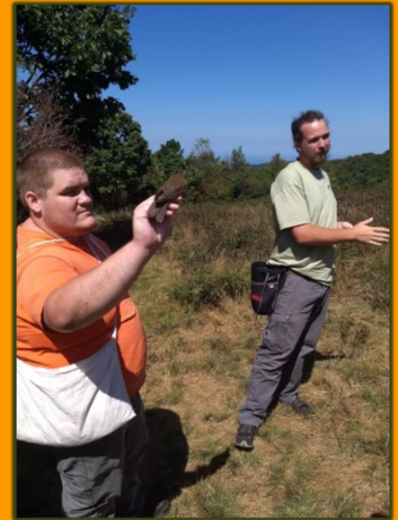
Birds are released after being measured and banded for identification.