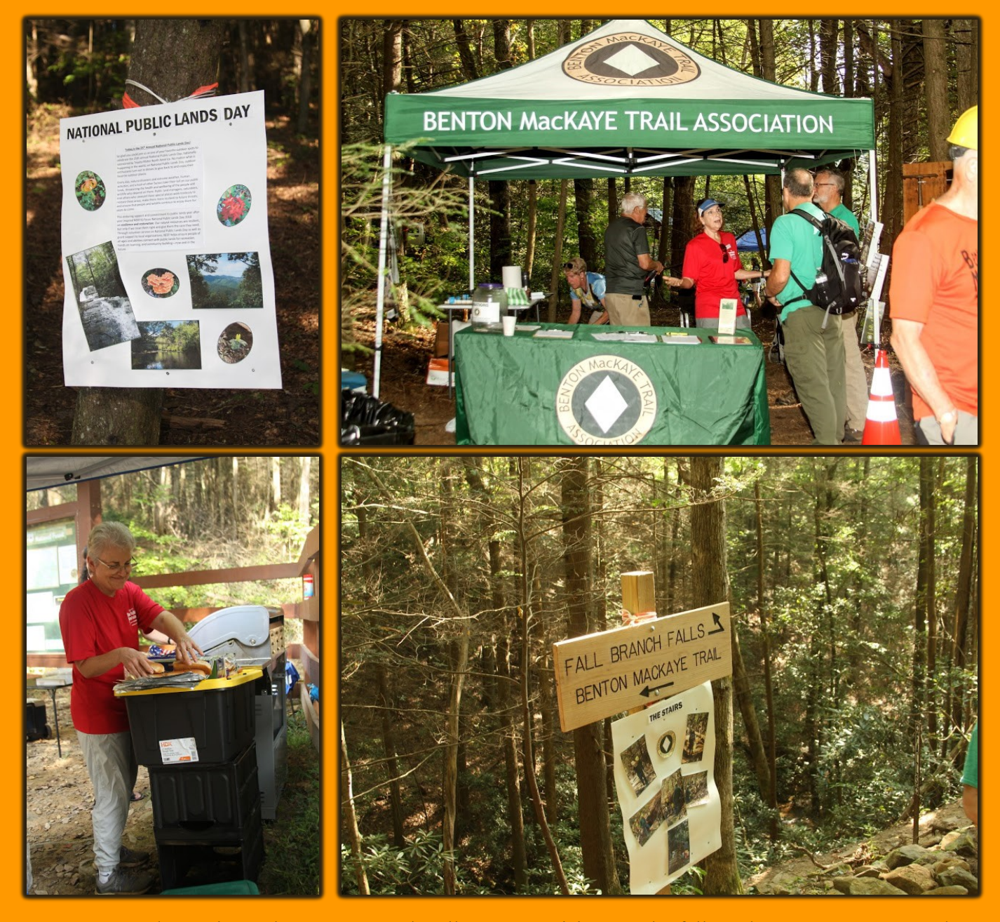
BMTA's Grand Opening volunteers greeted well over 360 visitors to the falls and everyone was treated to complimentary morning coffee and donuts and / or a cold iced bottle of water and a hot dog in the afternoon.

Volunteers put in 1,480 man hours battling roots and stumps on a steep hillside. Four-man teams lugged 40 six-by-sixes uphill to be used for cribbing to stabilize the trail in steep areas as well as for the 37 steps connecting the half-mile reroute with the old trail.