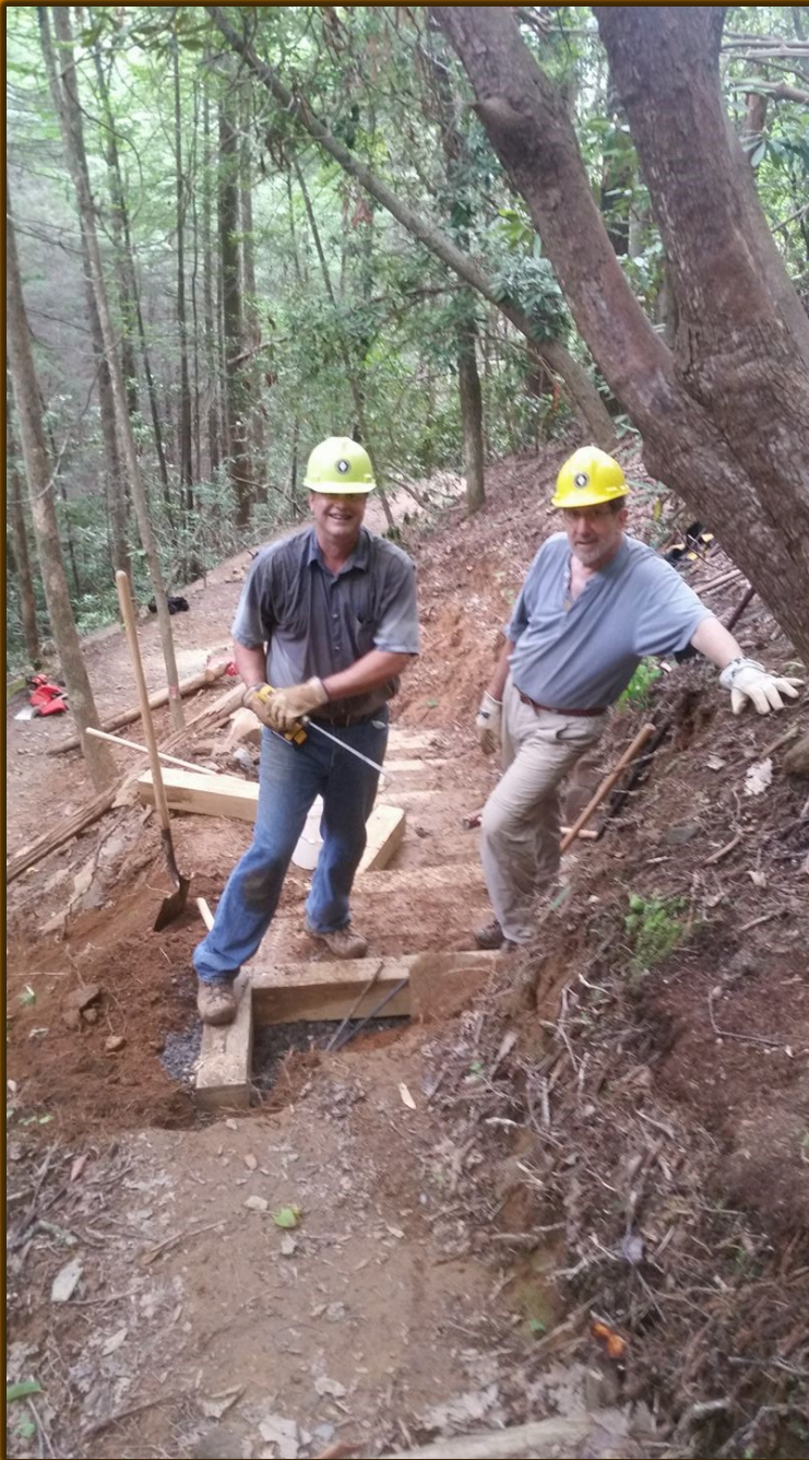
Taking it one step at a time!!