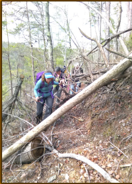
Undeterred by blowdowns!!