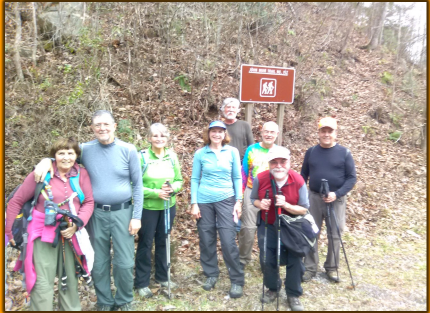
Happy faces, tired but looking for more!!!