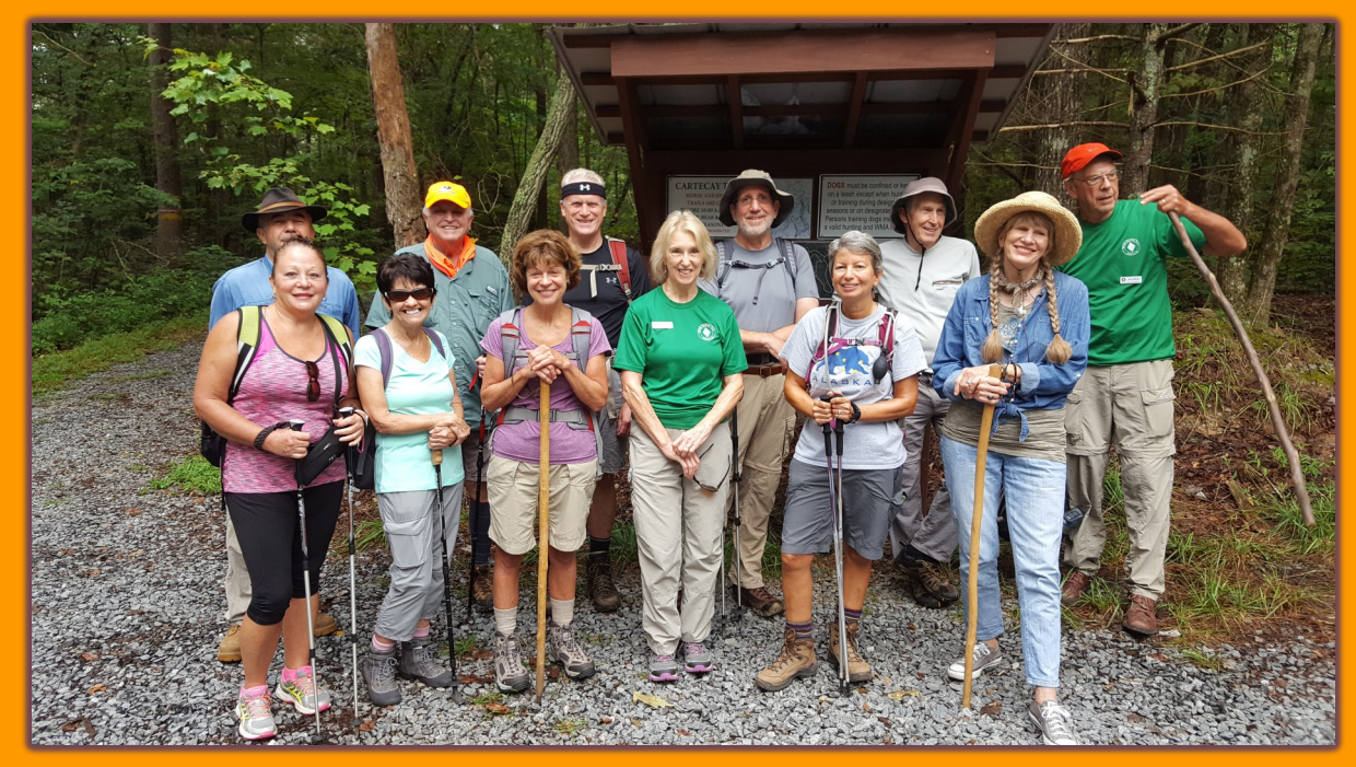
We had a great group of forest lovers that day. It was great to welcome newcomers:

It was a hot day on August 16 when 14 eager hikers took off on the 3.9 mile Cartecay Loop Trail. We met at Food Lion in Ellijay to carpool to the trail head off Mulkey Road in Ellijay. Upon arrival we took our usual group photo (while we were fresh) and headed out. Although most of us have hiked this trail several times we always look forward to pondering the beauty of the robust Cartecay River.