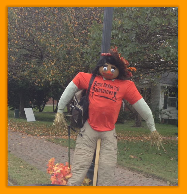
BMTA Maintainer Fall Fashion Look