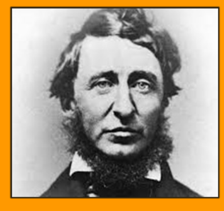
"In wilderness is the preservation of the world"-Thoreau