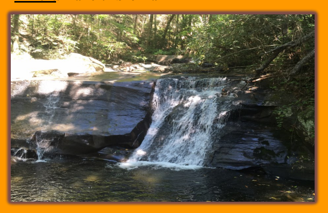
Middle falls from lunch spot.