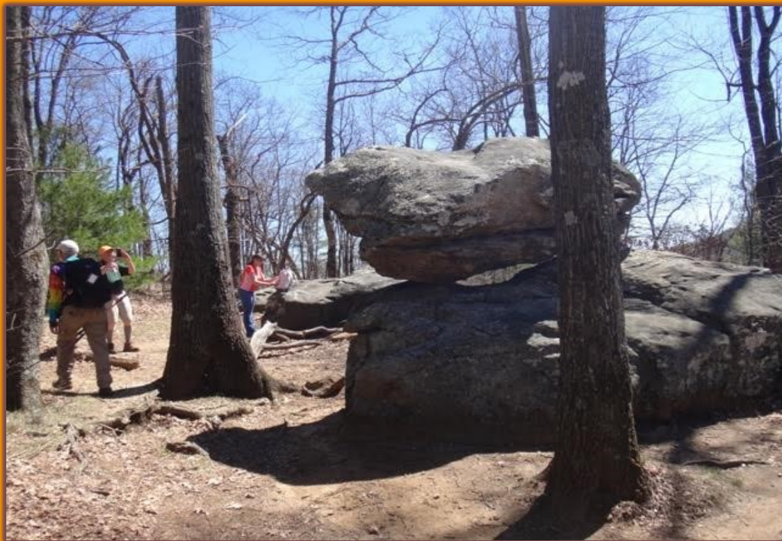
The hikers took a short side trip to the mysterious balancing rock on the AT.

The Blood Mountain section of the AT is the most traveled section in Georgia and the highest point on the AT in Georgia. People are drawn to it because of the easy access via HWY 19/129 between Blairsville and Dahlonega. The historic nature of the Blood Mountain shelter, nearby Mountain Crossings at Neels Gap and of course the views, make this a unique and memorable day hike. It is certainly not an easy one, but it's very doable for anyone in reasonable shape. If you plan to make this hike, take plenty of water and start hiking by at least 1:00pm.