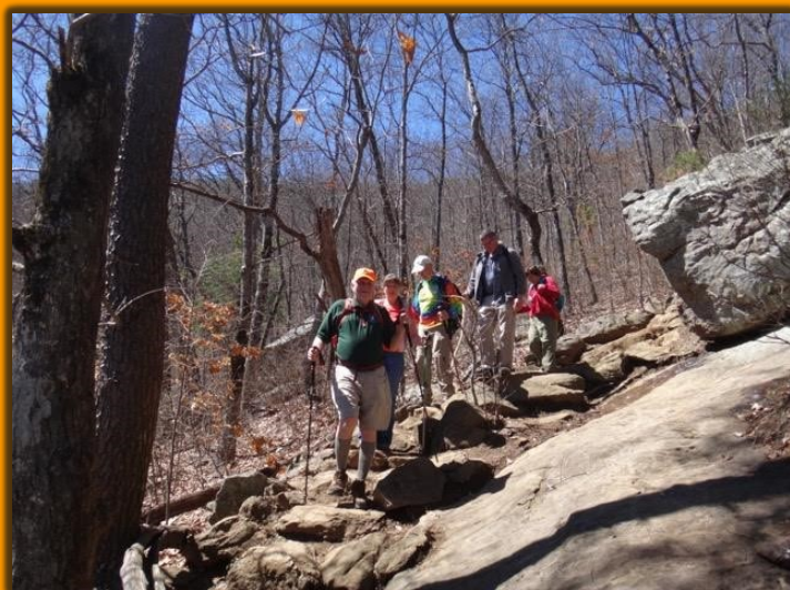
On the downhill half of the hike.