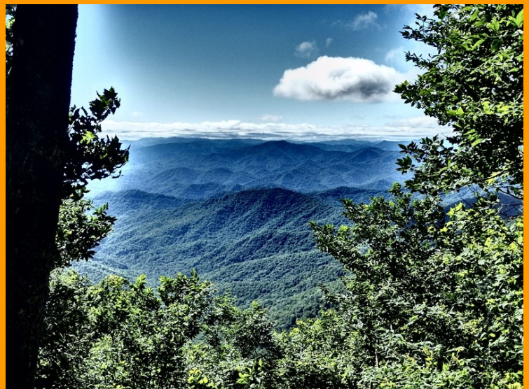
The stunning view from Naked Ground