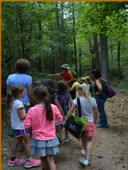
Be Prepared! Plant lessons!