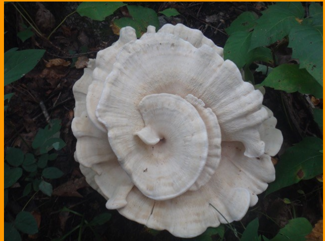
These giant fungi were about 12" across!