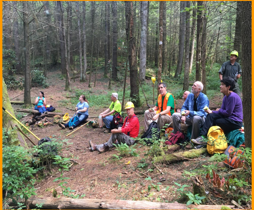
Ah!! The sweetness of hard work !