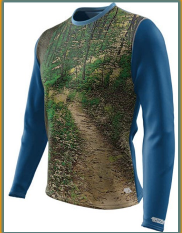
Available at Terra Outfitters, in Blue Ridge, GA or available on-line at: http://terra.atayne.com/ Atayne