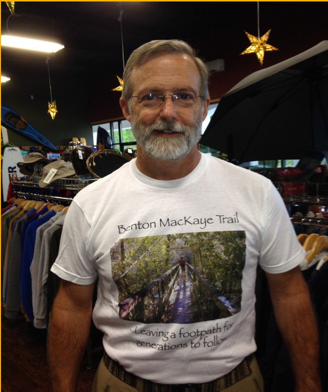
Available at North Georgia Mountain Outfitters in Ellijay, GA : http://www.hikenorthgeorgia.com/

It's not too early to be thinking about holiday gifts and what better way to combine giving to friends and family while also benefitting the BMTA!? Support not only the BMTA but our Corporate Members who offer a variety of products that satisfy your every preference, cotton or wicking.