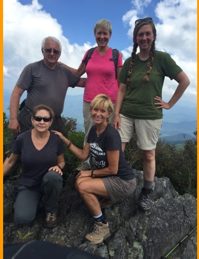
Worth the climb to the Hangover!!

During the 2016 Annual Meeting, we are scheduling hikes along most of this section, so come join us and hike a part of the BMT most have never been on!