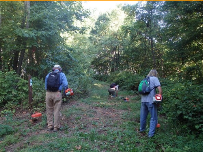
Maintenance along Yellow Creek

Despite being more than 32 miles long, there are only three named peaks along the Trail in Graham County, Stratton Bald (5,341 feet), Haeo (5,249 feet), and Yellow Creek Mountain (3,246 feet). Bob Bald lacks the required vertical difference to officially be a separate peak. Stratton Bald is the second-highest peak on the entire Benton MacKaye Trail, with only Mount Sterling, at 5,842 feet, being the first. In fact, hiking northbound from Stratton Bald, you have to go close to 100 miles to attain the same elevation, near the Laurel Gap Shelter in the Great Smoky Mountains National Park.