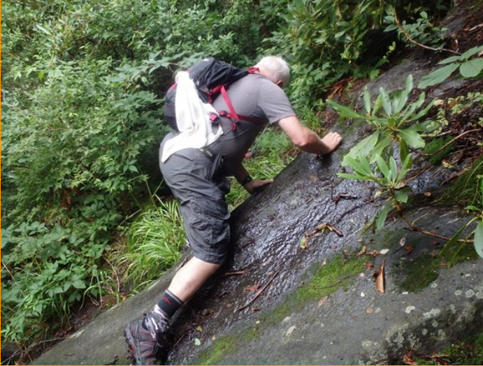
Below the Hangover!!!

There are now no significant water crossings, except the bridged crossing near Tapoco Lodge; however, there are so many small creeks in the Slickrock area that we can't count them all. Although there are water sources near Bob Bald, just off the trail near the Hangover, and many along the Windy Gap/Nichols Cove Trails, the section between Tapoco Lodge and Fontana Village is essentially a dry hike. The few sources in that area dry up in scarce rain conditions.