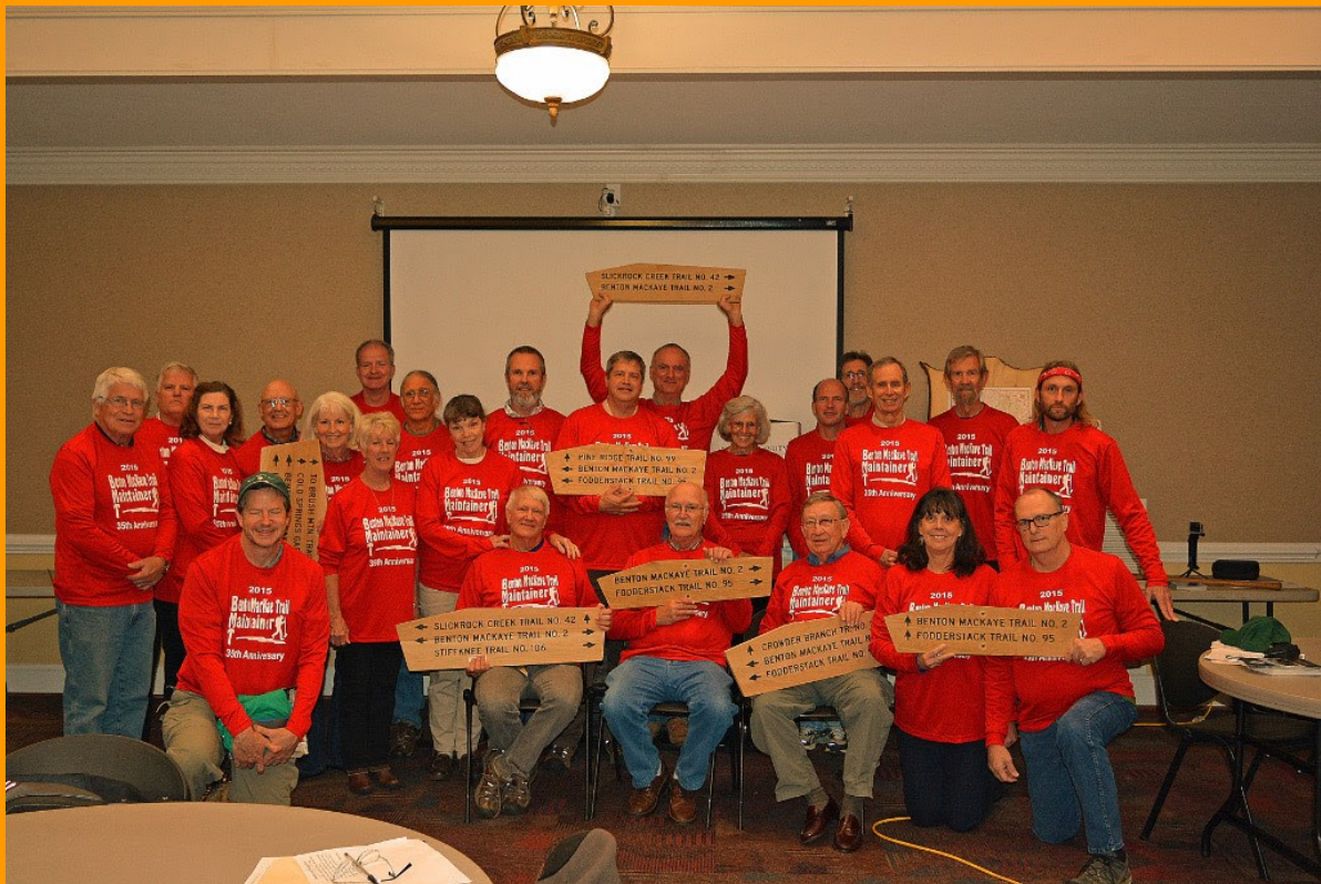
2015 “Spiffy” Maintainers with their “Spiffy” shirts!!! What a crew!!!

Everyone who has recorded a total of thirty hours will receive a spiffy BMTA Trail Maintainer shirt. This is BMTA's way of saying thank you for your contribution to this fundamental function of the BMTA. If you attend the annual meeting, you will receive it there and be included in the annual group photo.