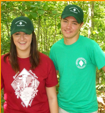
Also many items are available at the BMTA store!!