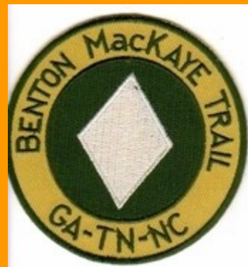
Get your patch!