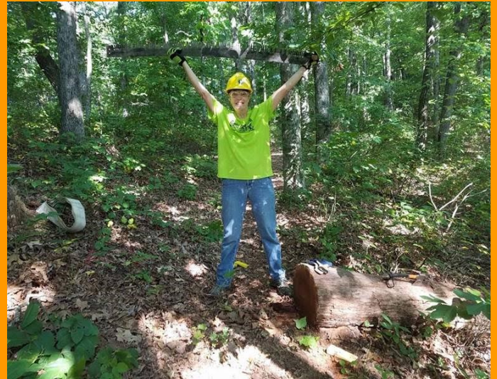
Hmm. Wife handles Very Sharp Object with ease

We were glad to welcome another first time worker for our monthly work trips, Alan McClure. Alan has agreed to take on this section of the BMT, and we are certainly glad to have him with us. With all of the good help we were able to brush out another mile of the trail, and log out all of the blow downs except for two very large trees within the first mile of the trail coming in from US 64. We have now brushed out about half of the section this summer.