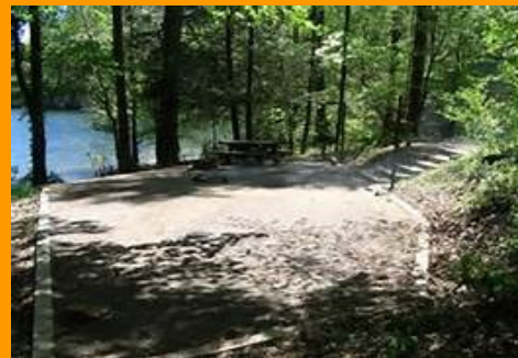
Horse Cove Campground

NOTA BENE: Both of these sites are first come, first served (i.e. no reservations). The only amenities are a privy or porta potty. Neither will have drinking water after October 31. So BYO or filter – though you could fill water containers at the lodge easily for Calderwood.