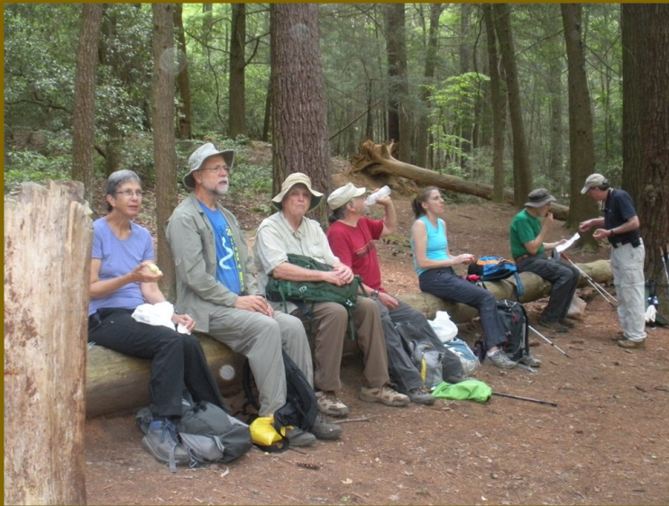
Lunch with a view! Enjoying lunch while watching the river roll by.

We crossed the bridge and found a nice place with some downed trees to eat our lunch, complete with a view of the fast moving river. Lots of Mountain Laurel were in full bloom along the river bank. When we got off the bridge, we felt like drunken sailors. The bridge swings you side to side instead of up and down like the old time swinging bridges some of us are familiar with.