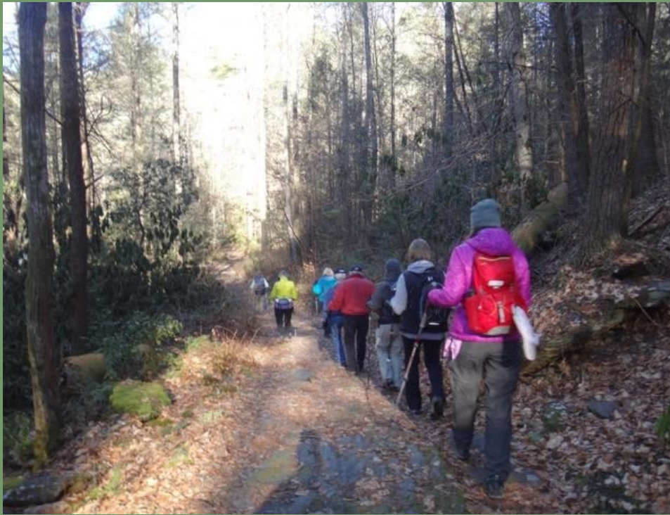
Setting out for the Falls