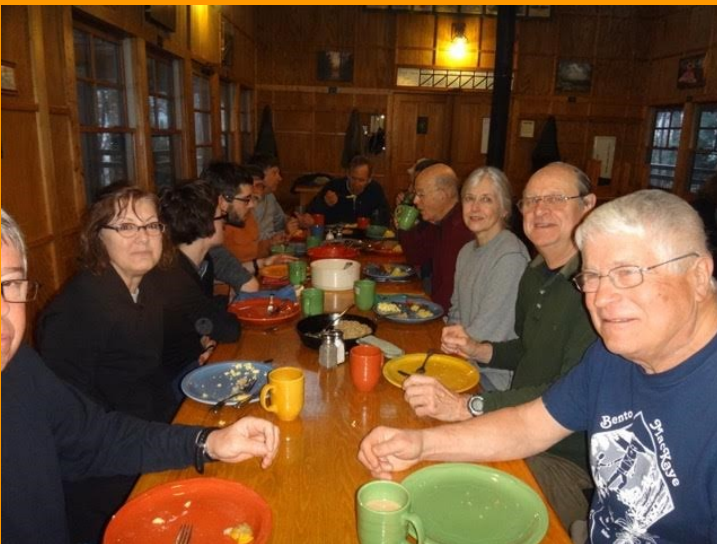
A hearty breakfast!!

I think 100 percent of our Hike-Inn group is looking forward to a return trip, although perhaps with a bit more favorable weather.