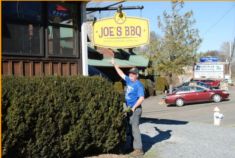
Nothing like good BBQ!

We were on the trail for 3.5 hours. After the hike and the shuttle to retrieve all the vehicles, we decided that we could not make it to Poole's in Ellijay in time for supper. We had read about Joe's BBQ in Blue Ridge. Trip Advisor has named it the best in the United States based on posted reviews. We found it to be very good. Nothing like a good hike to give you an appetite!