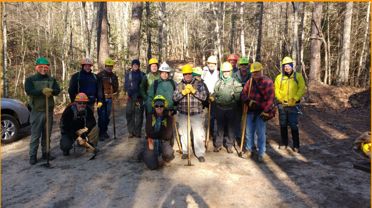
Intrepid students of the Constitution with frozen smiles and numbed digits!