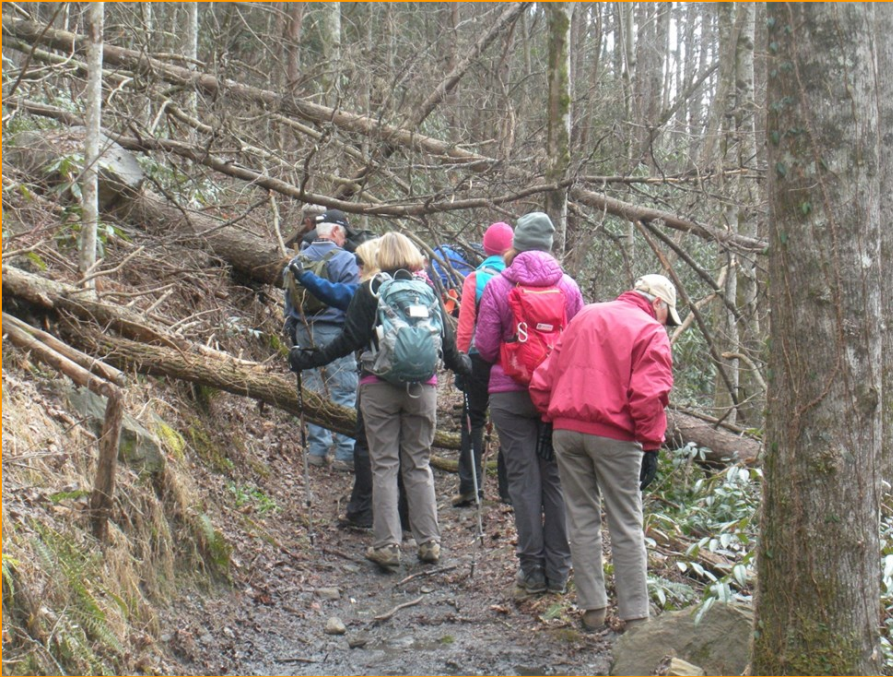
A couple of the blow downs that resulted from high winds the night before.

The Brush Creek Trail is pretty level the entire distance with only minor elevation changes. What was so hard for us to believe is that just about 50 years ago this whole area was so devastated by the fumes from the nearby Copper Smelting Plant that there was not a single blade of grass, tree, or anything growing. Now the area is indistinguishable from an undisturbed forest. The rhododendrons, mountain laurel, native plants, and wildflowers that previously would have been growing here are back like they used to be. About the only clue to the ecological disaster is the lack of giant trees that we normally encounter in forested trails.