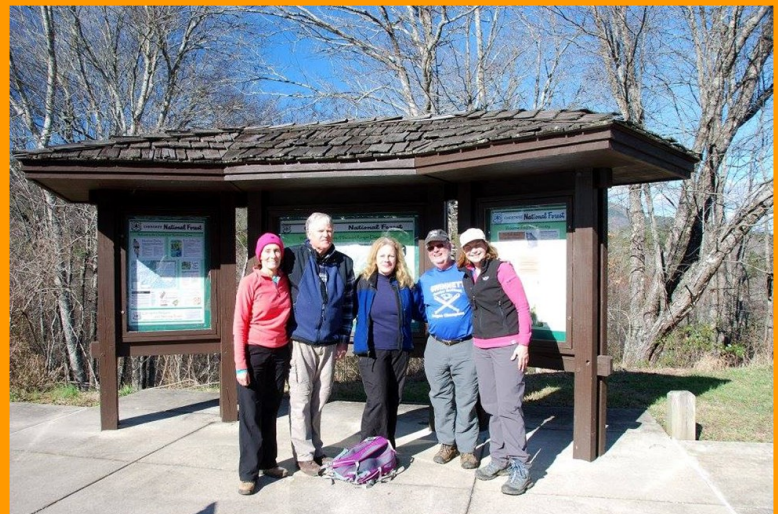
Enjoying the great winter weather!!!