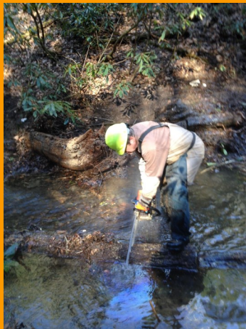
More than one use for hip waders!