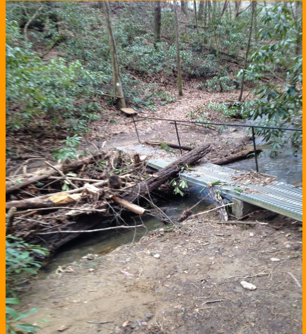
Logs and debris jammed against bridge