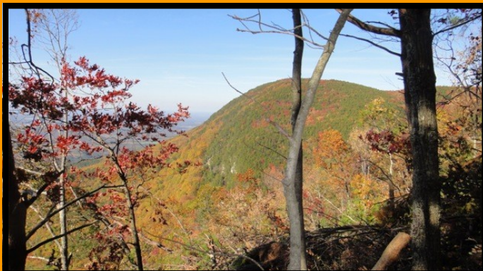
A view of Fort Mountain from the Gahuti Trail