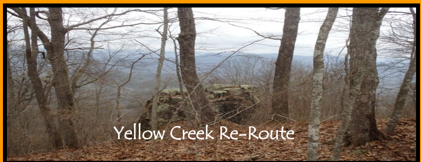
Yellow Creek Re-Route