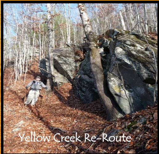
Yellow Creek Re-Route