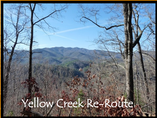
Yellow Creek Re-Route

We need your help! Join us on any (or all) of these trips for this major reroute of the trail.