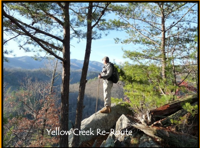
Yellow Creek Re-Route