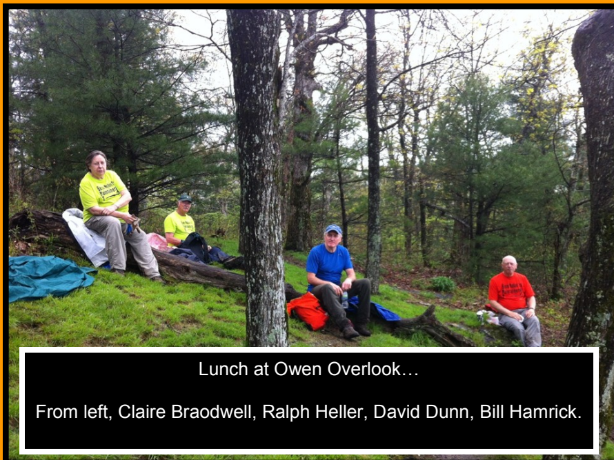
Lunch at Owen Overlook...