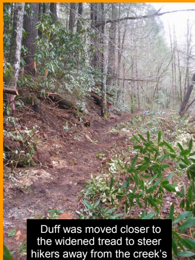
Duff was moved closer to the widened tread to steer hikers away from the creek's edge while others walked the tread to smooth it out as much as possible.