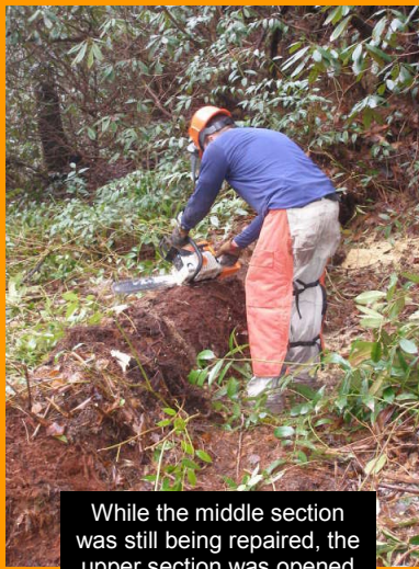
While the middle section was still being repaired, the upper section was opened up so the new trail could rejoin the main tread.