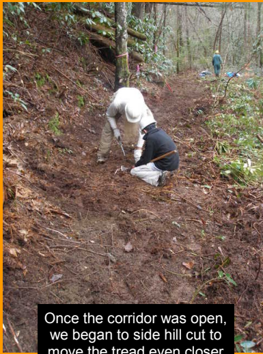
Once the corridor was open, we began to side hill cut to move the tread even closer to the wall and began removing roots