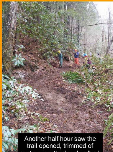
Another half hour saw the trail opened, trimmed of roots, smoothed and walked back down to the original trail tread.

Thanks to Shawn Basil for the pictures and the captions. A complete write up of this trip can be found at: http://hikinghq.net/forum/showthread.php?7286-Work-Maintenance-Trip-on-the-BMT-the-Heart-of-Darkness!&p=309237#post30923