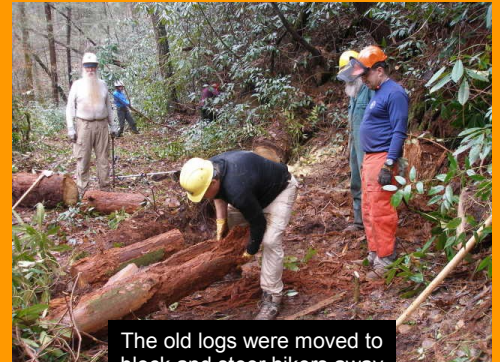
The old logs were moved to block and steer hikers away from the old route.