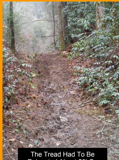
The Tread Had To Be Relocated About 50' On Either Side Of The damage To make a Seamless Reroute.