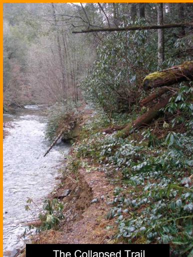
The Collapsed Trail