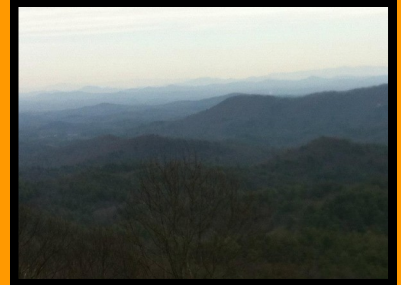
Late winter view east toward Brasstown Bald from FS Road 64 near Dyer Gap. Blue Ridge tucked in the valley.

Much of the work on the March trip involved adding knicks and other water diversions to the side-hilling done on previous trips. The big final challenge was the installation of an "entrance ramp" to scale the 12 foot high bank that separated Forest Service Road 64 from the newly relocated trail. The impressive result, engineered by trip co-leader Barry Allen and a crew of four, can be seen in the accompanying photo.