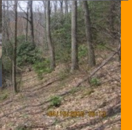
"Stream Mile" 119... Four Seasons On The BMT