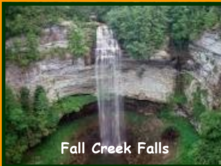
Fall Creek Falls