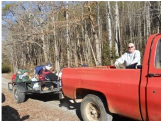
...but they had to work hard before they got the ice cream!

This section of the BMT on Section 07A on the old road bed along a creek is now a pleasant walk with the eyesore trash removed.