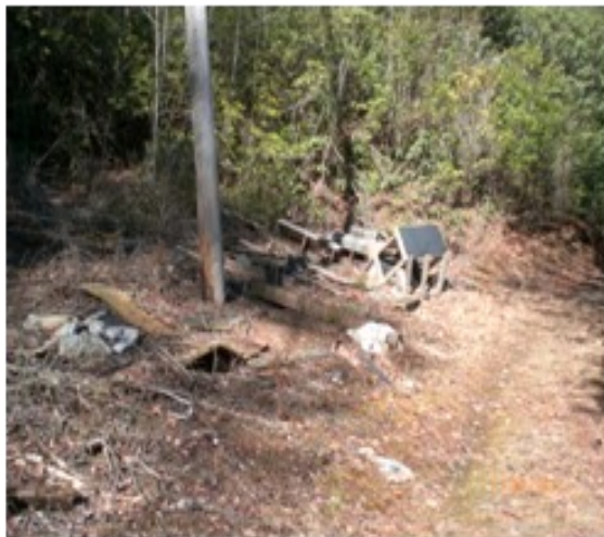
Above: It is doubtful that a hiker left this trash.

This section of the BMT on Section 07A on the old road bed along a creek is now a pleasant walk with the eyesore trash removed.