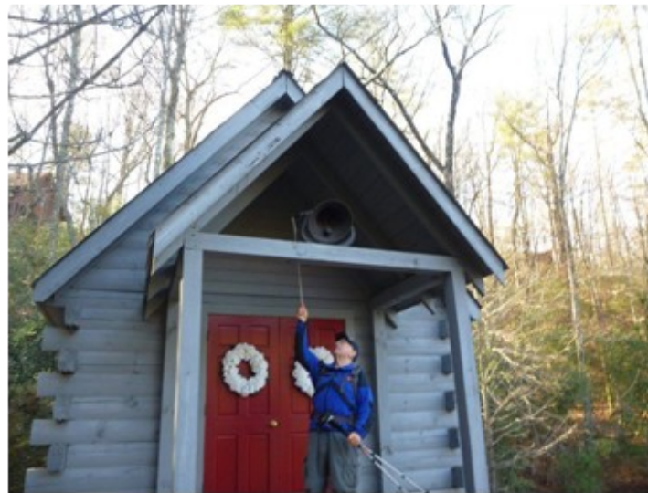
Left: George Owen at the Cherry Log chapel

Sparkling streams, hemlock coves, covered bridges and the BMT's only shelter are featured on the Cherry Log section of the BMT.