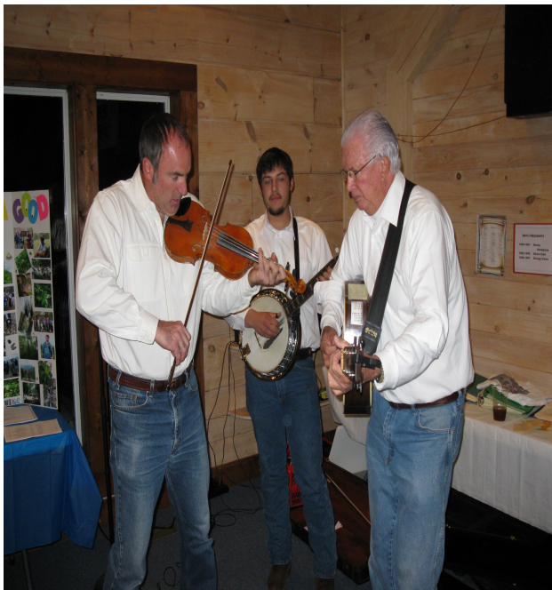
Bluegrass music accompanied the meal.