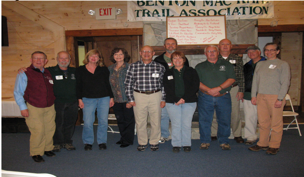
Incoming Board of Directors for 2011.